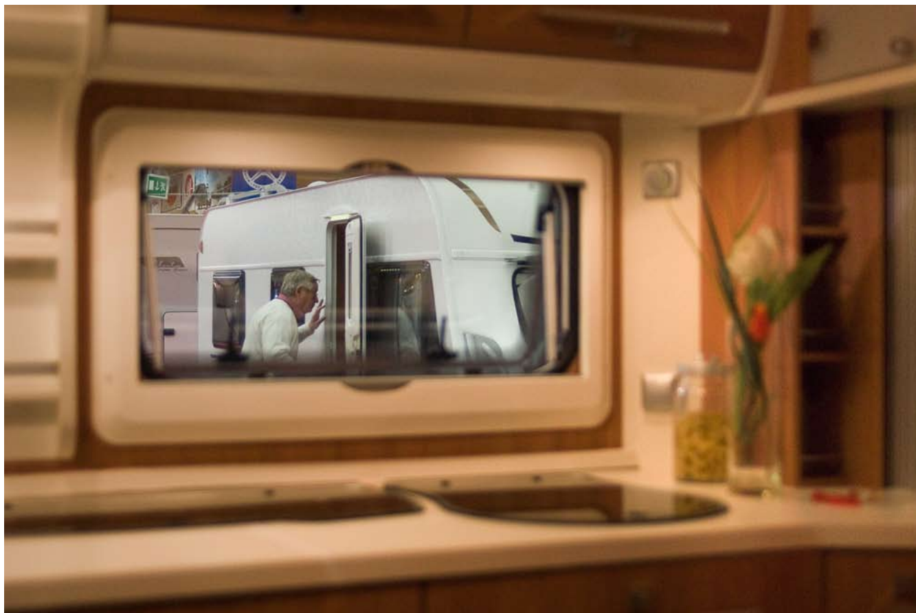
Caravan & Camping Fair