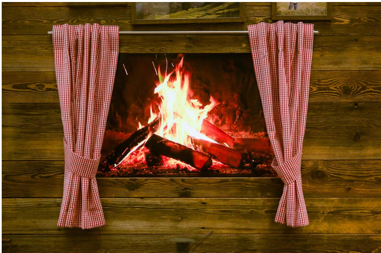
Interior Design Fair