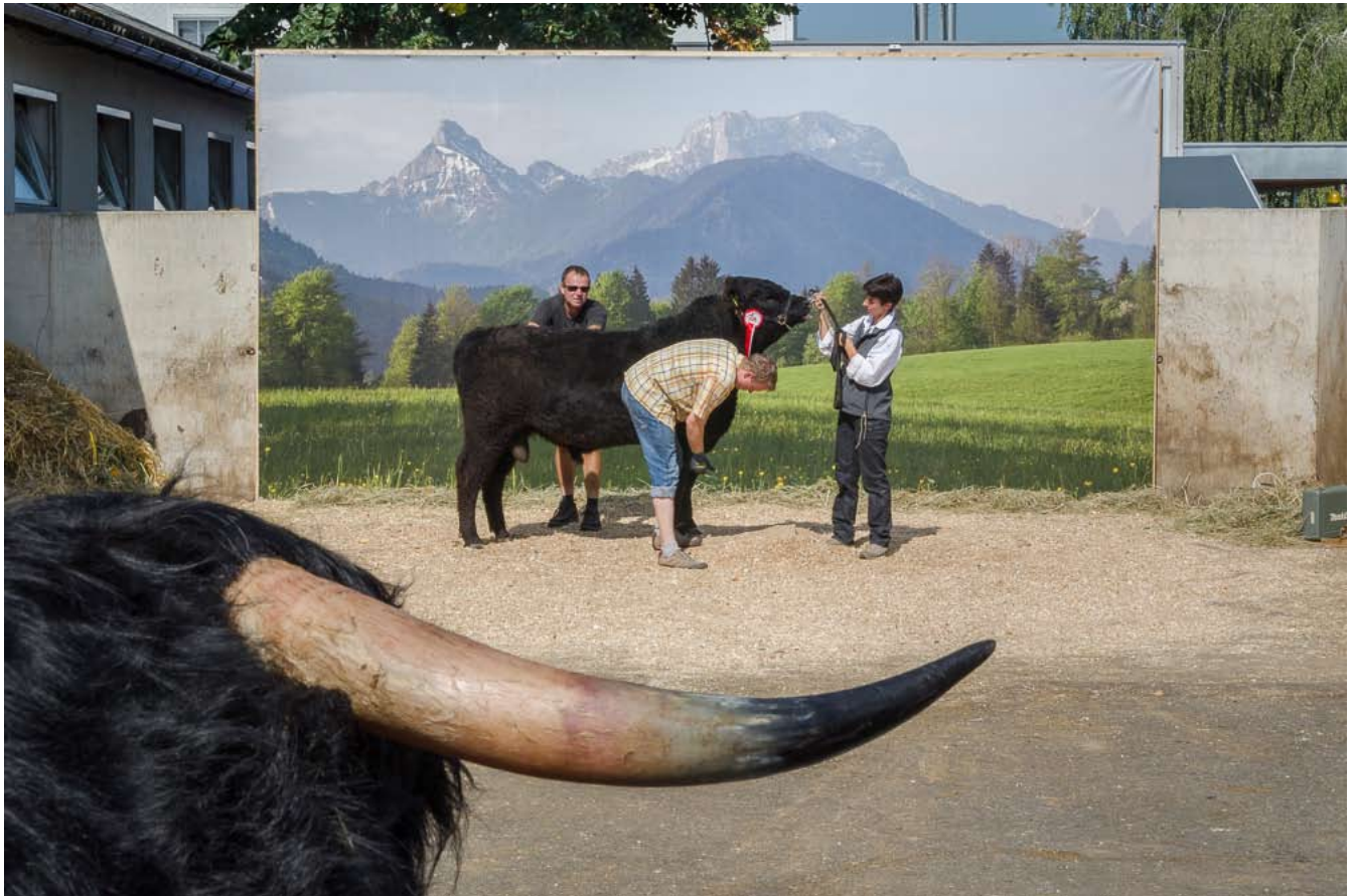
Agricultural Fair - Photo shooting of the breeding catalog