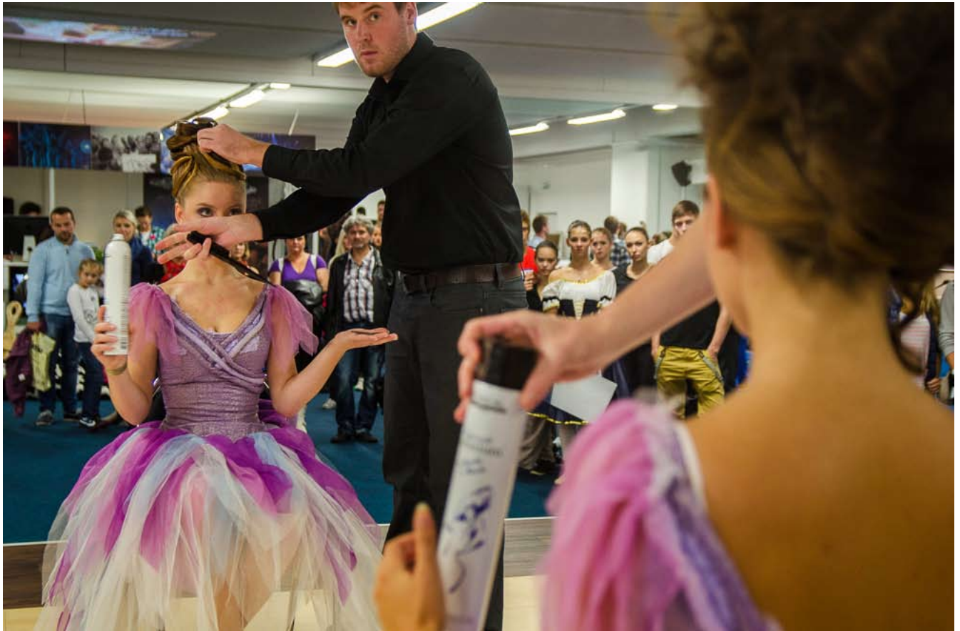
Beauty Fair - Synchronised hairdressing