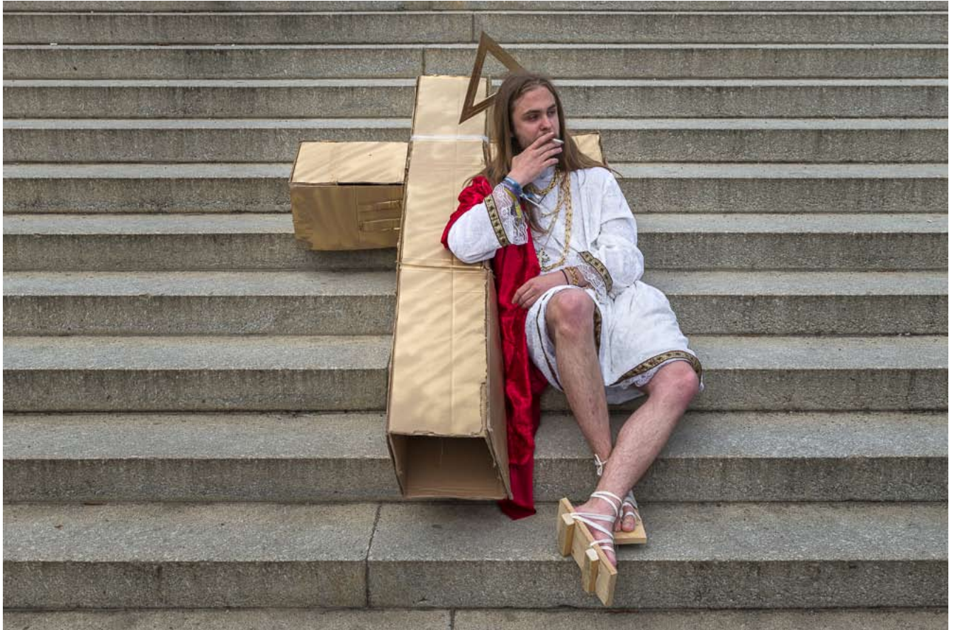
Anime & Cosplay Fair