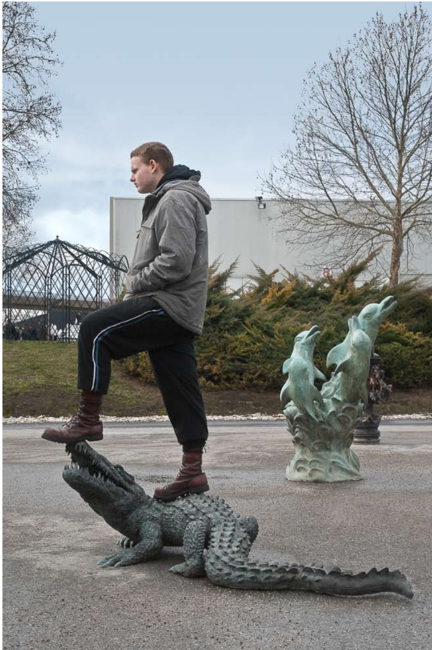
House & Garden Fair