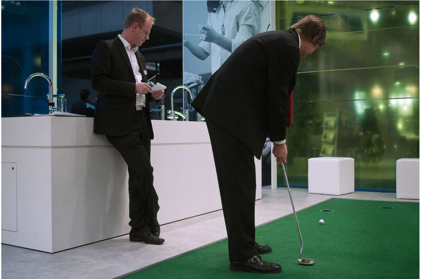
Kitchen & Bath Fair