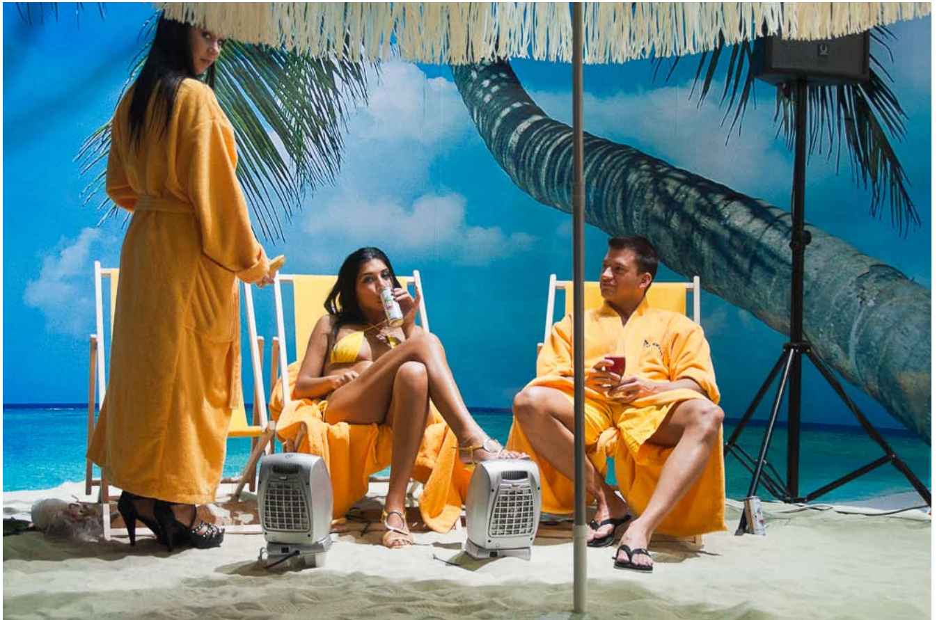
Holiday & Travel Fair